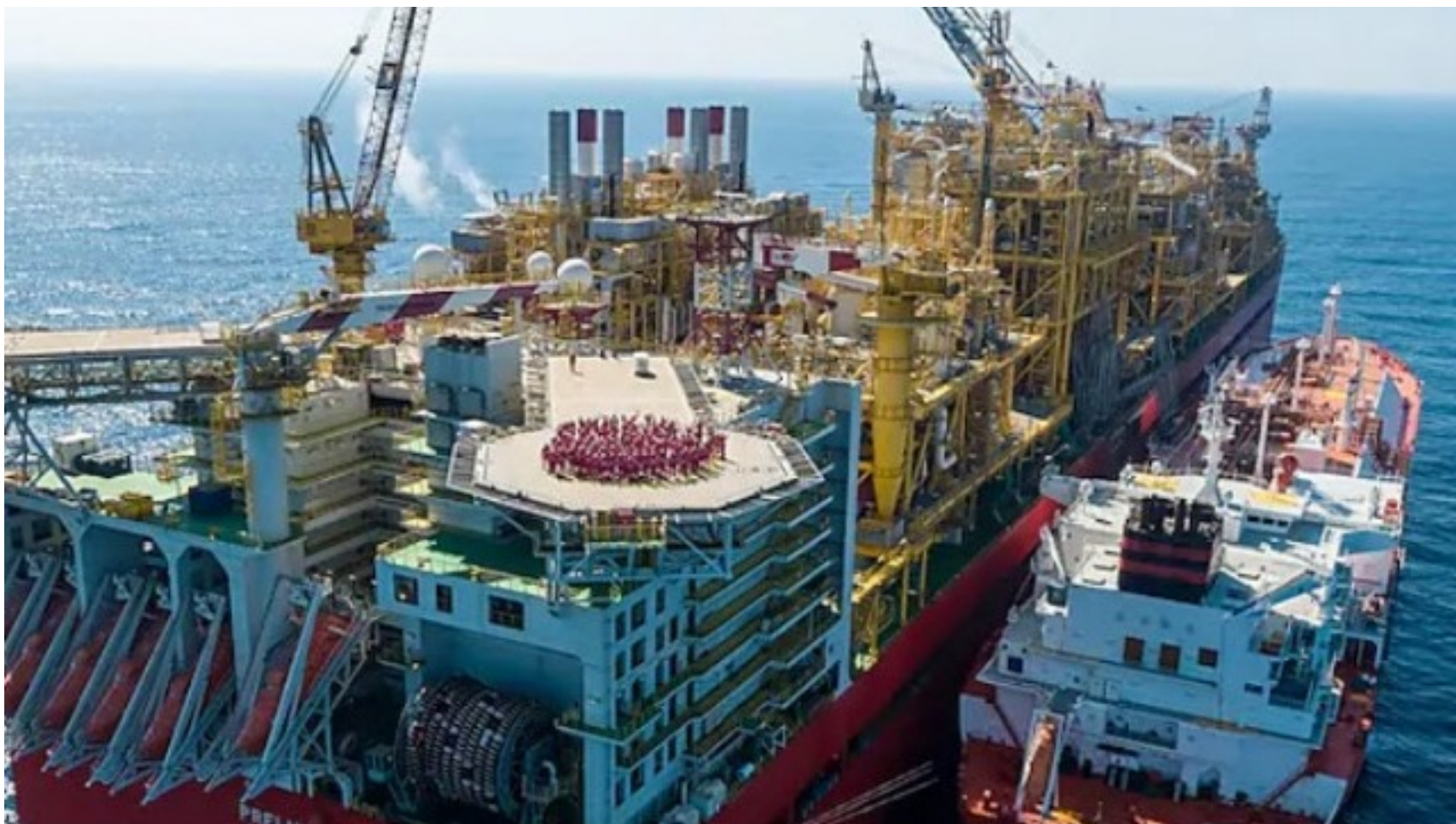
Prelude and Valencia Knutsen

BY MAREX (HTTPS://WWW.MARITIME-EXECUTIVE.COM/AUTHOR/MAREX) 2019-06-10 23:47:59